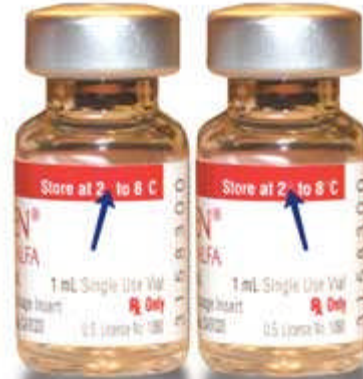
The counterfeit Epogen labels were almost identical to the labels for the real thing, except they did not have the degree symbol written next to the storage temperature.

After months of pounding on countless closed doors, Tim's story finally caught the attention of Congressman Steve Israel (D-Huntington), whose district includes Deer Park. Soon after their meeting in 2003, Israel proposed a new federal law to combat